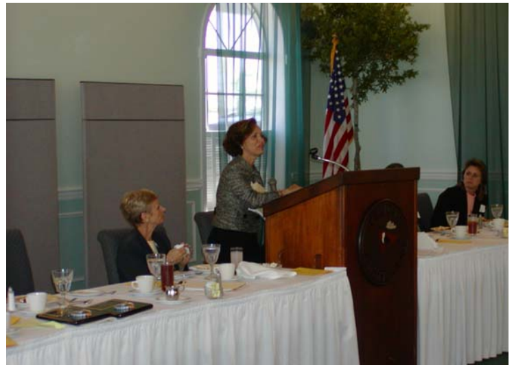
Chief Justice of the Florida Supreme Court, Barbara Pariente, from the dais addressed the members of the St Lucie County Bar Association.