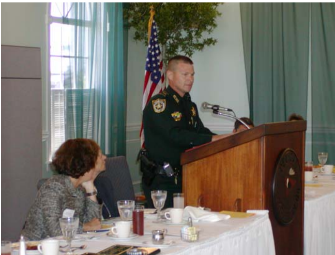
Lt Hardy addressed the bar praising the performance of the men and women of the SLCSO who provide security day in and day out at the two St Lucie County Courthouses. His Marine Corps bearing impressed the Florida Supreme Court Chief Justice.